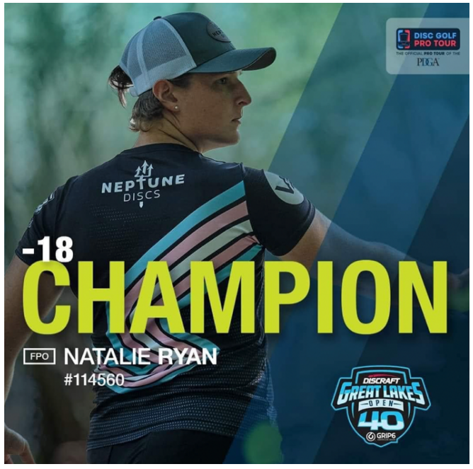
Photo 3: A male becomes the women's champion in disc golf in competition against Catrina Allen and other females.

workout plan and am known as a fighter, there is no outworking the physical advantages that a male has. I have since faced four different males in the female category in 26 different tournaments. The worst part is if the women speak out and share their feelings of defeat and frustration, they fear loss of sponsorships and the very public wrath of those defending the male athletes. The women feel helpless, scared, voiceless and isolated.